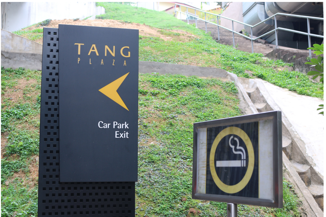
Other designated smoking areas are in open areas such as the back or side of buildings, marked out by yellow lines or signs.