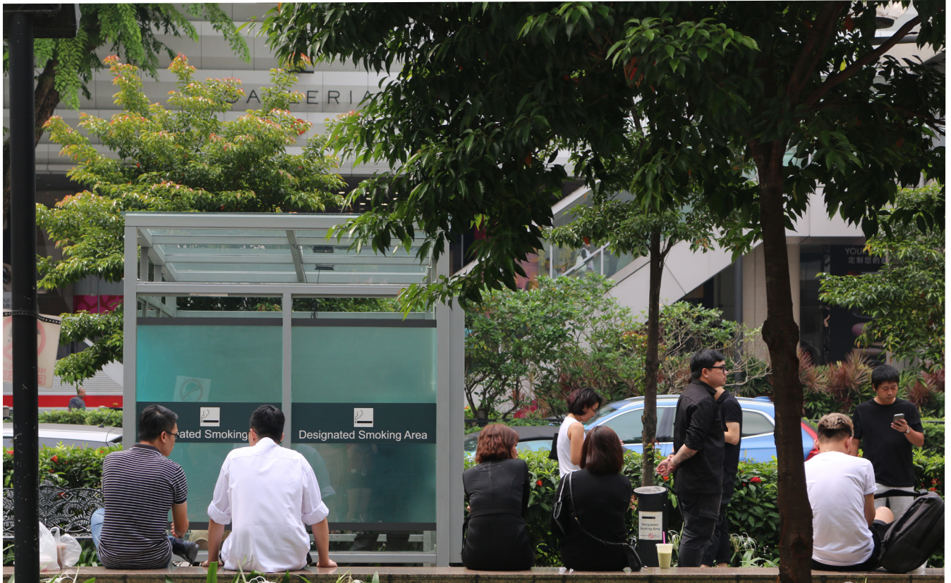
Over 40 designated smoking areas spaced 100m and 200m apart had been set up since November 22nd 2018.